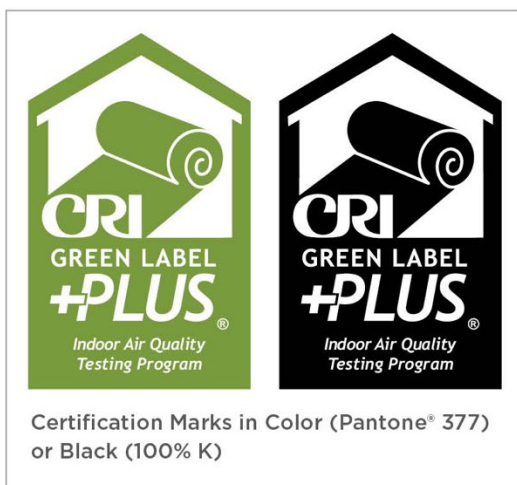
Certification Marks in Color (Pantone® 377) or Black (100% K)

CRI Green Label Plus certification mark artwork is available as shown below in green or black. Artwork for marks with a white border is also available for use on medium or dark background applications.