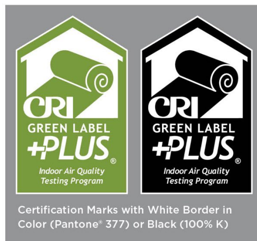
Certification Marks with White Border in Color (Pantone® 377) or Black (100% K)